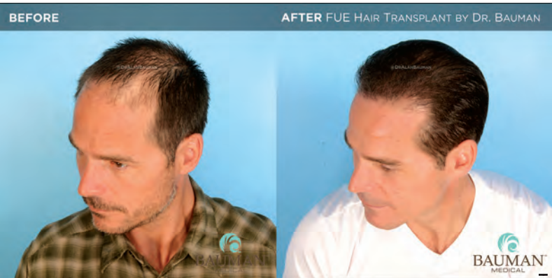
Before and 12 months after FUE Hair Transplant by Dr. Alan Bauman

FUE (Follicular Unit Extraction) is one of Bauman Medical’s most popular hair restoration technologies. We employ several types of FUE, depending on your particular need or situation. Using robotics, or with the aid of mechanical instruments, we harvest hair follicles directly from the scalp, replacing the older, invasive method of “strip harvesting.” FUE hair transplantation allows for the harvesting of follicles without leaving behind a telltale linear scar and with the added benefits