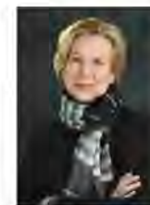
The Latest Addition to TEAM Vollara, Dr. Deborah Birx M.D. Chief Medical and Scientific Advisor

No Matter Where You Live, Work, Teach, or Play—Live Fully With Confidence™