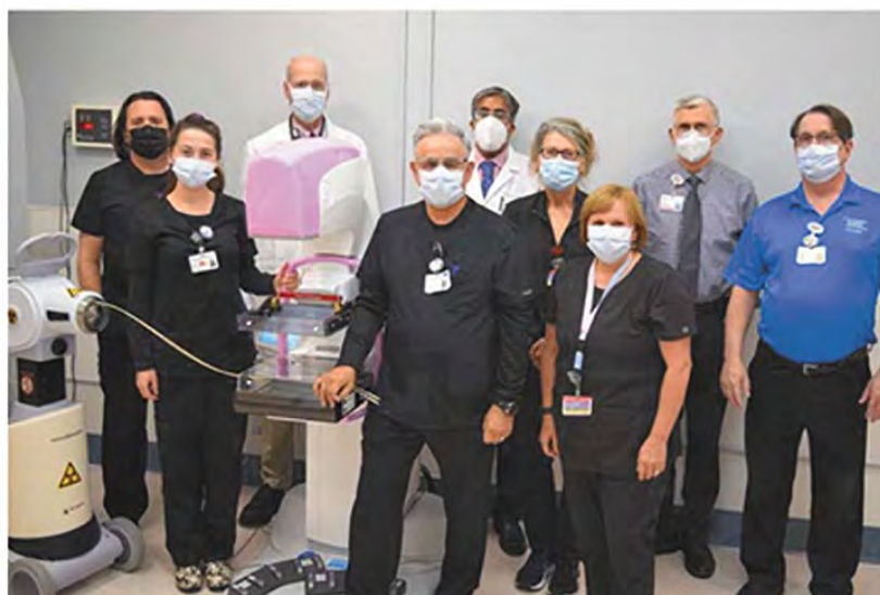
St. Joseph's Hospital is the first in Tampa Bay to offer the PreciseRT.