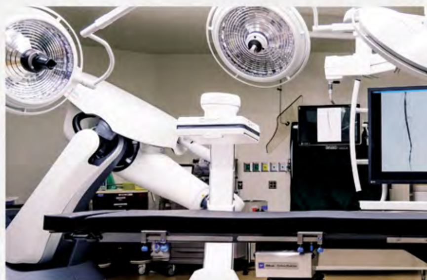
St. Joseph's Hospital's state-of-the-art hybrid operating room