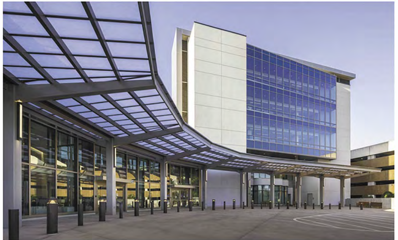
St. Anthony's Hospital, a part of the BayCare Health System, opened its new patient tower earlier this year.

It was the consistent performance of St. Anthony's and the health system's other hospitals that helped BayCare remain a Top Quintile Hospital System.