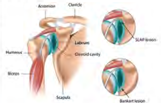
Example of Labral Tears

One of the most common clinical findings in orthopedic testing for labral tears is, specifically, clicking and popping. Several orthopedic tests we use in our office assess for clicking. When the shoulder is stressed in different angles and positions, if there is a sound elicited in the movement, it can suggest a labral tear. Also, if pain and weakness is found in other orthopedic tests in combination with this "noise," we can add labral tear to the short list of what could be the issue in the shoulder. Orthopedic testing in the office is a great tool to make educated guesses about what the shoulder pathology might be; however, this can only be confirmed by diagnostic imaging. A Regenxx physician would perform orthopedic tests on your shoulder, paired with a diagnostic ultrasound to assess the possibility of a labral tear, and then if suspected, we also order an MRI to evaluate the integrity of the labrum. Our physicians can treat confirmed shoulder labral tears with PRP or BMAC.