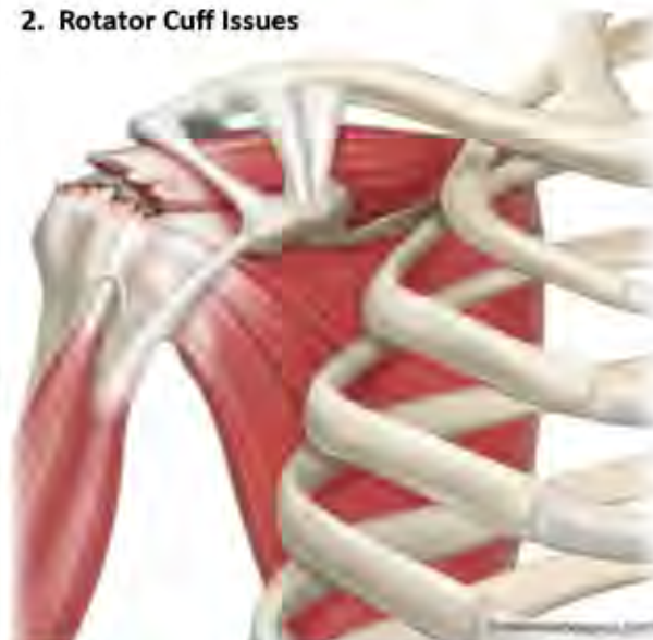
Example of a Rotator Cuff Tear

The rotator cuff is a set of four muscles that are responsible for moving the arm bone on the shoulder blade in different directions. These muscles are pretty small, but also get overused and beat up