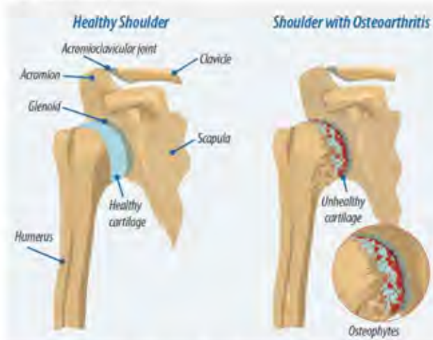
Healthy Shoulder vs Shoulder with Osteoarthritis

Arthritis is an insidious process of degeneration when bones begin to rub on each other. When this happens is not only weakens and destroys the protective cartilage coating, but it causes inflammation.