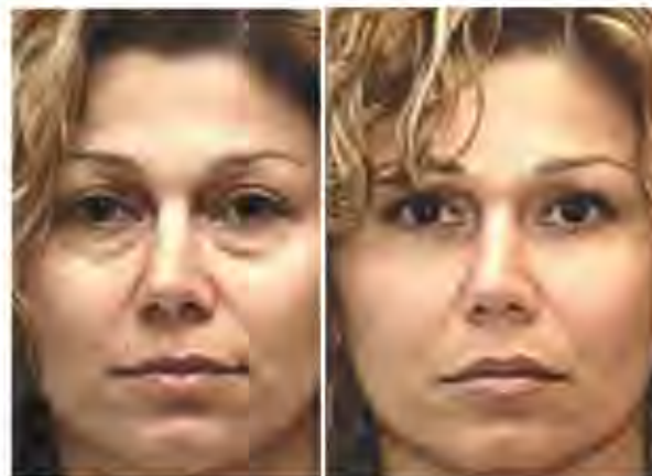
Before and After - 1 Hour

Mr. Santino: We have helped patients with facial irregularities such as a birth mark. Severe acne scarring can definitely be improved and corrected. Often a stroke can affect the face. In the case of a stroke, we can treat only the affected side of the face for a natural symmetrical correction.