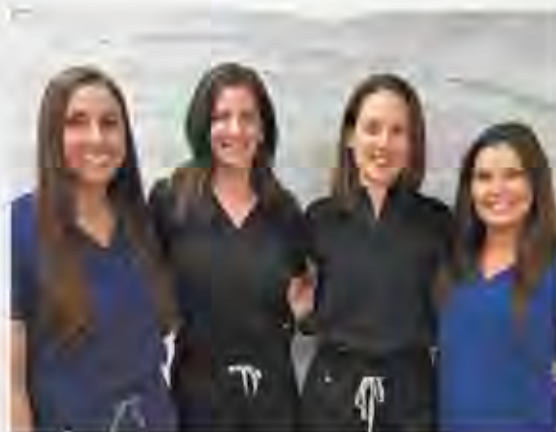
From left to right:

I evaluate, analyze, and treat the skin. I am comfortable addressing a variety of skin issues including skin cancer, moles, acne, eczema, rosacea, and psoriasis. I am also passionate about teaching you how to prevent and treat these conditions.