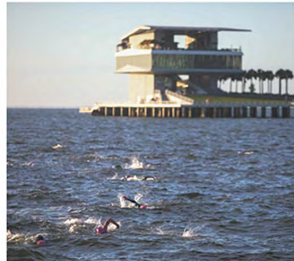
Swimmers glide through Tampa Bay with the St. Petersburg Pier in the background at the St. Anthony's Triathlon.

The events feature a swim in Tampa Bay for athletes in the Olympic- and Sprint-distance races; a bike ride that takes athletes by modern high rises and into quiet neighborhoods whose streets have been described as flat and fast; and a run through one of St. Petersburg's oldest neighborhoods. The Meek & Mighty features a pool swim.