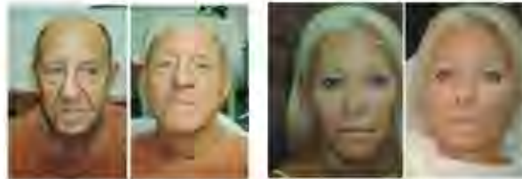
Before and After Stem Cell Face Lift – 1 Hour

Stem Cells are the body's growth factor. They are immortal. You produce stem cells for life from the bone marrow. Not as many at age eighty as at age twenty, but your body produces stem cells throughout your entire life. For example, if you get a cut or injury, a signal is released to the bone marrow to release these growth factors. The stem cells travel through the blood system to the injury to promote healing. At the site of the injury, the stem cells help heal and develop bone, skin, blood, or specialized cells necessary for the body to heal itself.