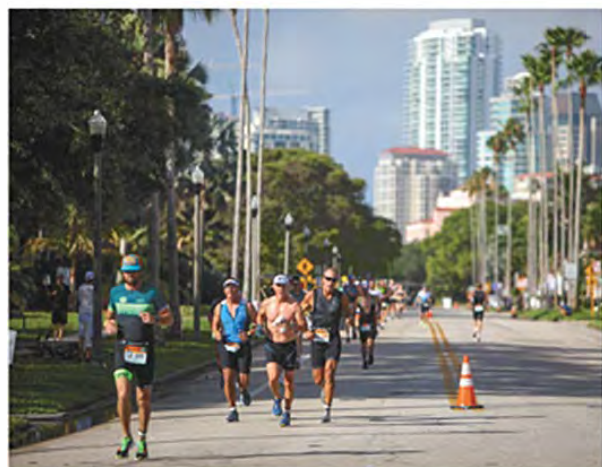
The city of St. Petersburg skyline and other city locations are highlights of the St. Anthony's Triathlon.